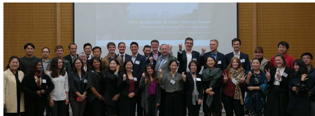
Sustainable & Smart Tourism Forum | Seoul, South Korea - Oct. 10 & 11, 2016

Tel. +82 (0)10-9497-0343 E-Mail cg.hamel@hotmail.com